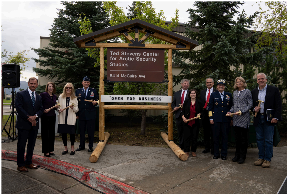
Distinguished visitors participate in the TSC's grand opening ceremony at Joint Base Elmendorf-Richardson, Alaska, Aug. 11, 2022.