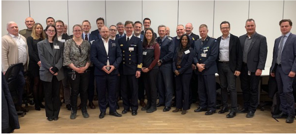
Highlights from the Swedish Defence University visit.