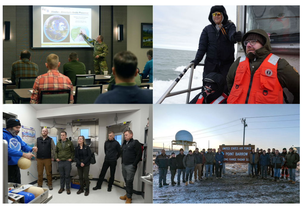
Highlights from the Arctic Defense Attaché Field Seminar