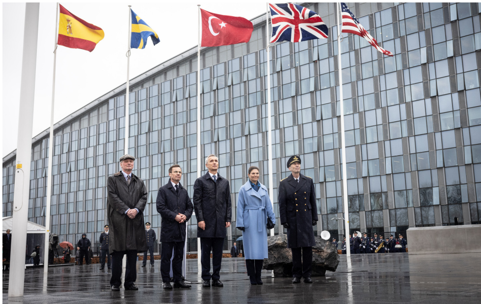
Raising of the NATO flag of Sweden during the Accession Ceremony. Left to right Axel Wernhoff (NATO Permanent Representative, Sweden); Ulf Kristersson (Prime Minister of Sweden); NATO Secretary General Jens Stoltenberg; Victoria, Crown Princess of Sweden; General Micael Bydén (Chief of Defence, Sweden)

East-West gaps in security perspective within the Alliance present additional intangible contributions.