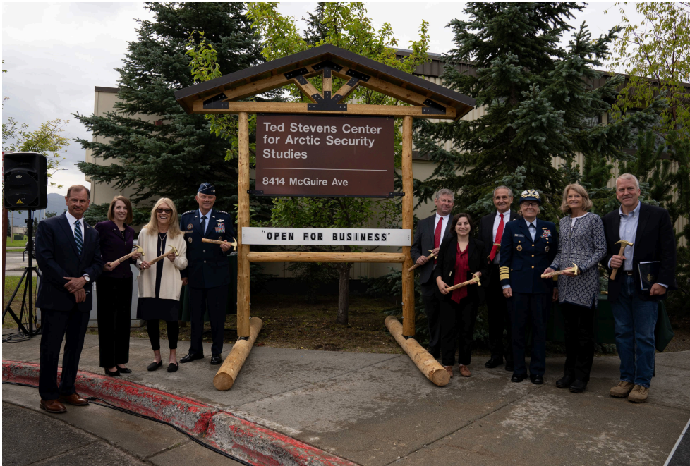
Distinguished visitors participate in the TSC's grand opening ceremony at Joint Base Elmendorf-Richardson, Alaska, Aug. 11, 2022.