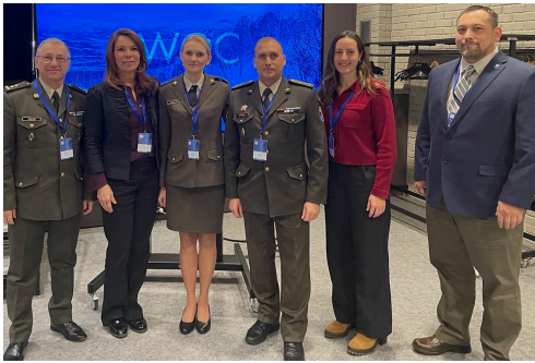
Ted Stevens Center members stand united with Ukrainian participants during the 2023 Cold Weather Operations Conference in Hamar, Norway.