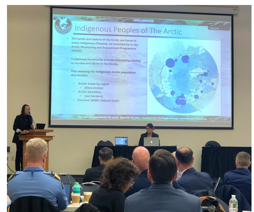
Highlights from the North Atlantic Arctic Crisis Response Workshop.