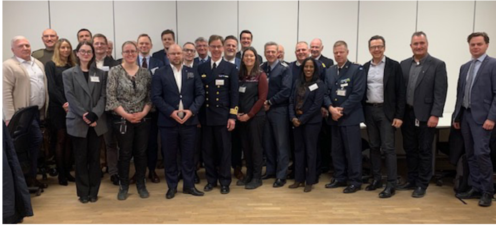
Highlights from the Swedish Defence University visit.