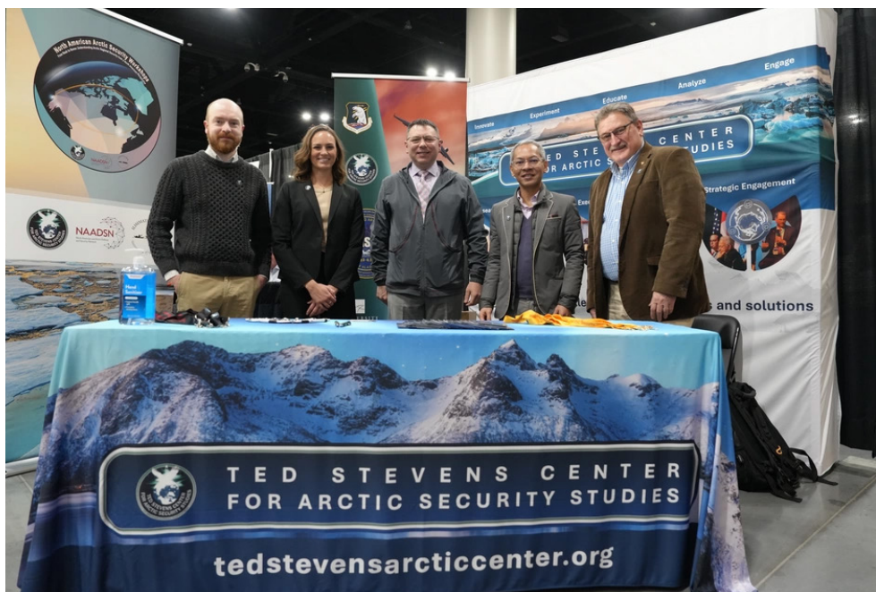
The Ted Stevens Center's booth at the 2023 Alaska Federation of Natives Conference