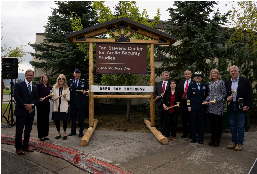
Distinguished visitors participate in the TSC's grand opening ceremony at Joint Base Elmendorf-Richardson, Alaska, Aug. 11, 2022.