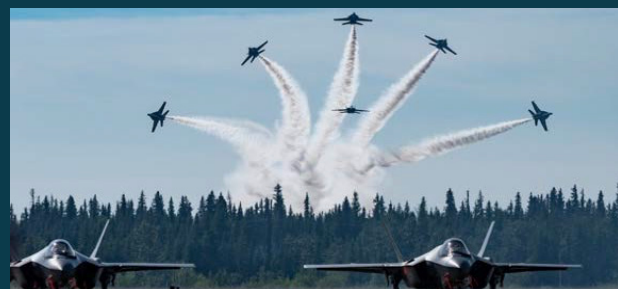
Eielson AFB F35 Demonstration.

This 30-hour course is taught virtually and consists of five days of instruction, panel presentations, and a capstone exercise. Proposed readings will be distributed prior to the course.