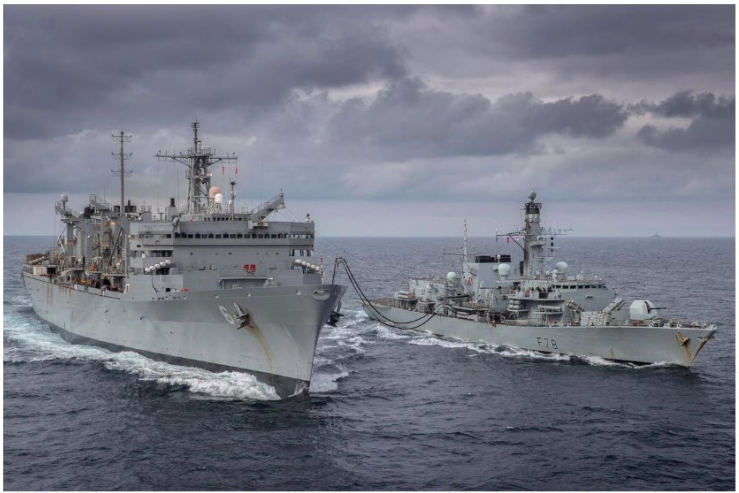
The Duke-class frigate HMS Kent (right) takes part in a replenishment-at-sea with Supply-class fast combat support sh Supply (T-AOE-6) while on exercise with the U.S. Navy in the Arctic Circle.

Four U.S. Navy ships and a U.K. Royal Navy ship sailed into frigid Arctic waters of the Barents Sea on May 4